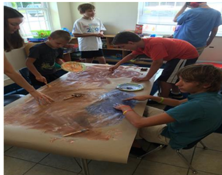
Fine Motor Art with shaving cream