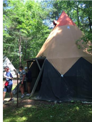
Hiking and visiting a teepee