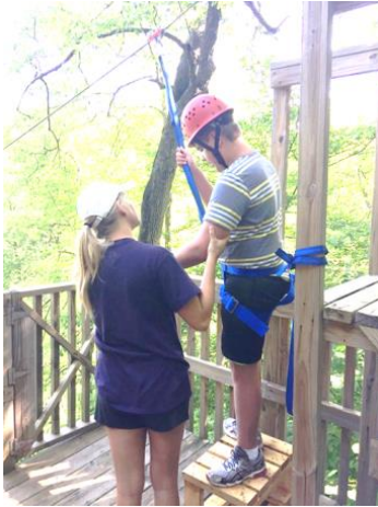
Getting Ready to Zipline