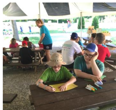
Arts and Crafts