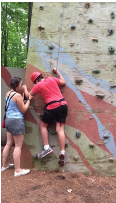
OAC Rock climbing