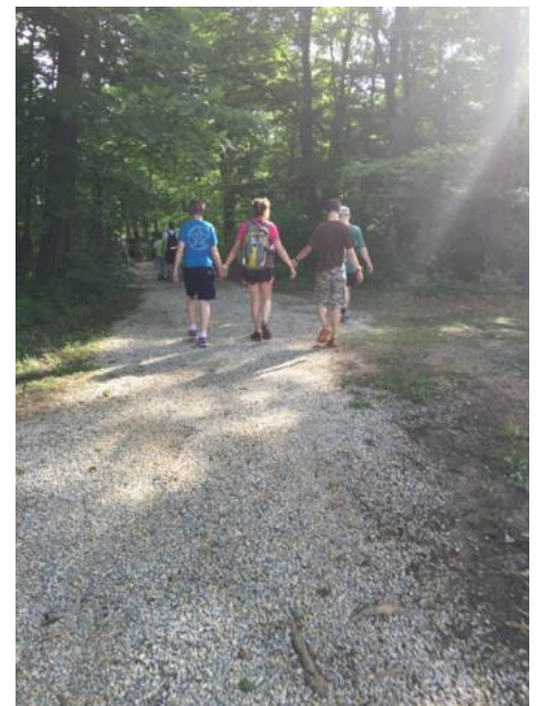
Enjoying a Leisure Hike